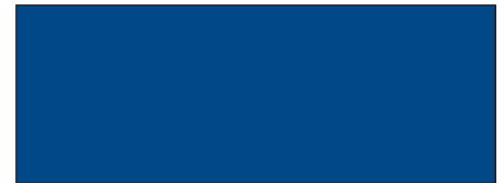
i 4583-2 Maritime Blue