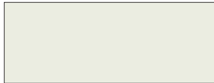
i 4633-2 Traffic White (RAL 9016)