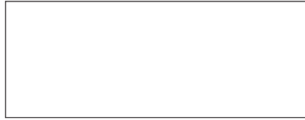
i 4728-2 Signal White (RAL 9003)