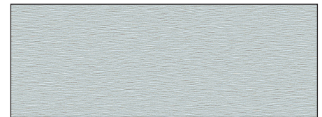
i 2200-2 Clear Laquer