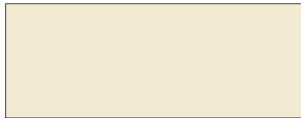
i 4601-2 Bahama White (RAL 9001)