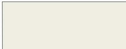
i 4988-6 Global White